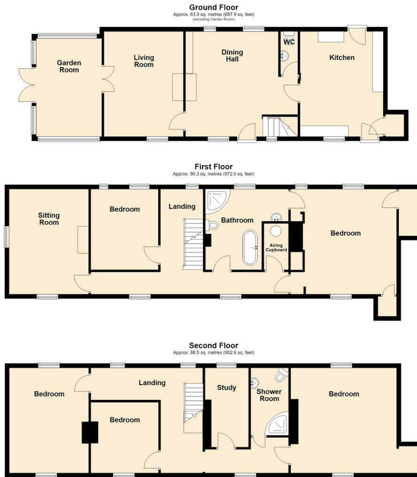
Kirkland House, Church Street, Southwell