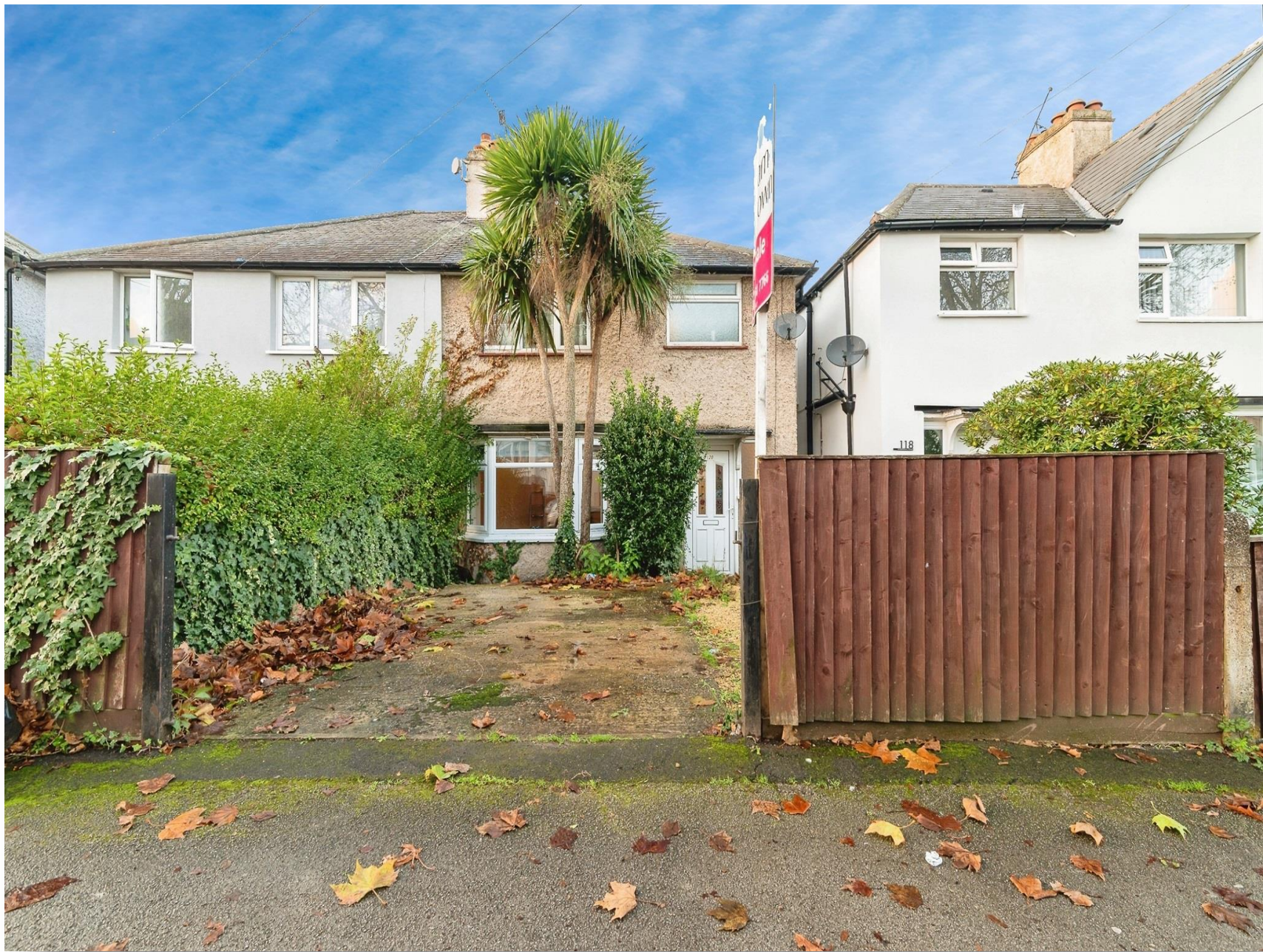
Bobbers Mill Road, Nottingham NG7 5JT