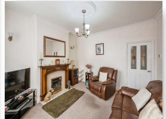
Cliffefield Road, Swinton Mexborough S64 8PX