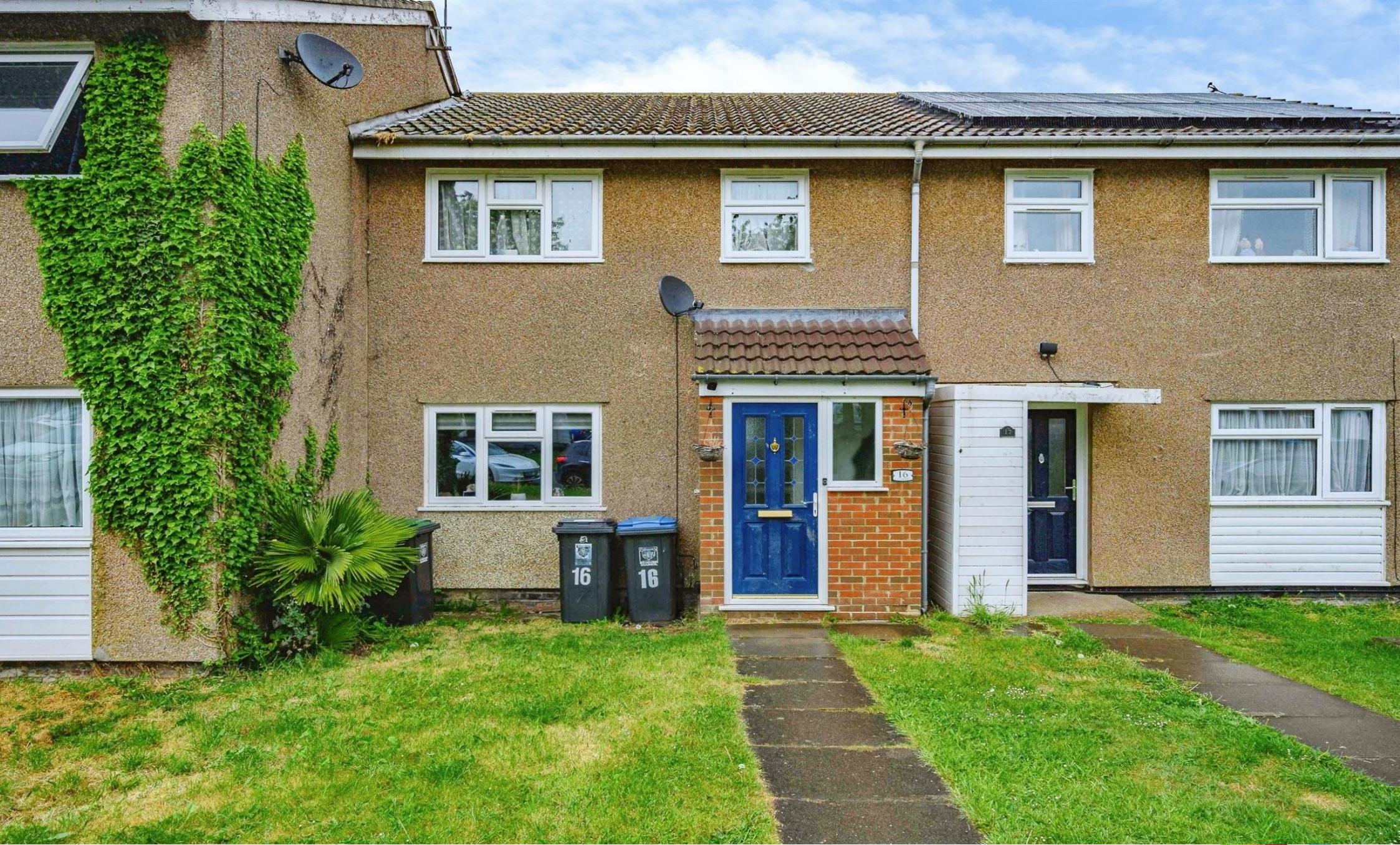
Claymore, Hemel Hempstead HP2 6LL