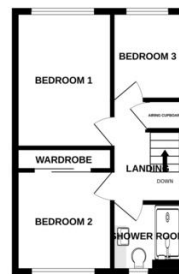
TOTAL FLOOR AREA: 913 sq.ft. (84.9 sq.m.) approx. Measurements are approximate. Not to scale. Illustrative purposes only Made with Metropix ©2026