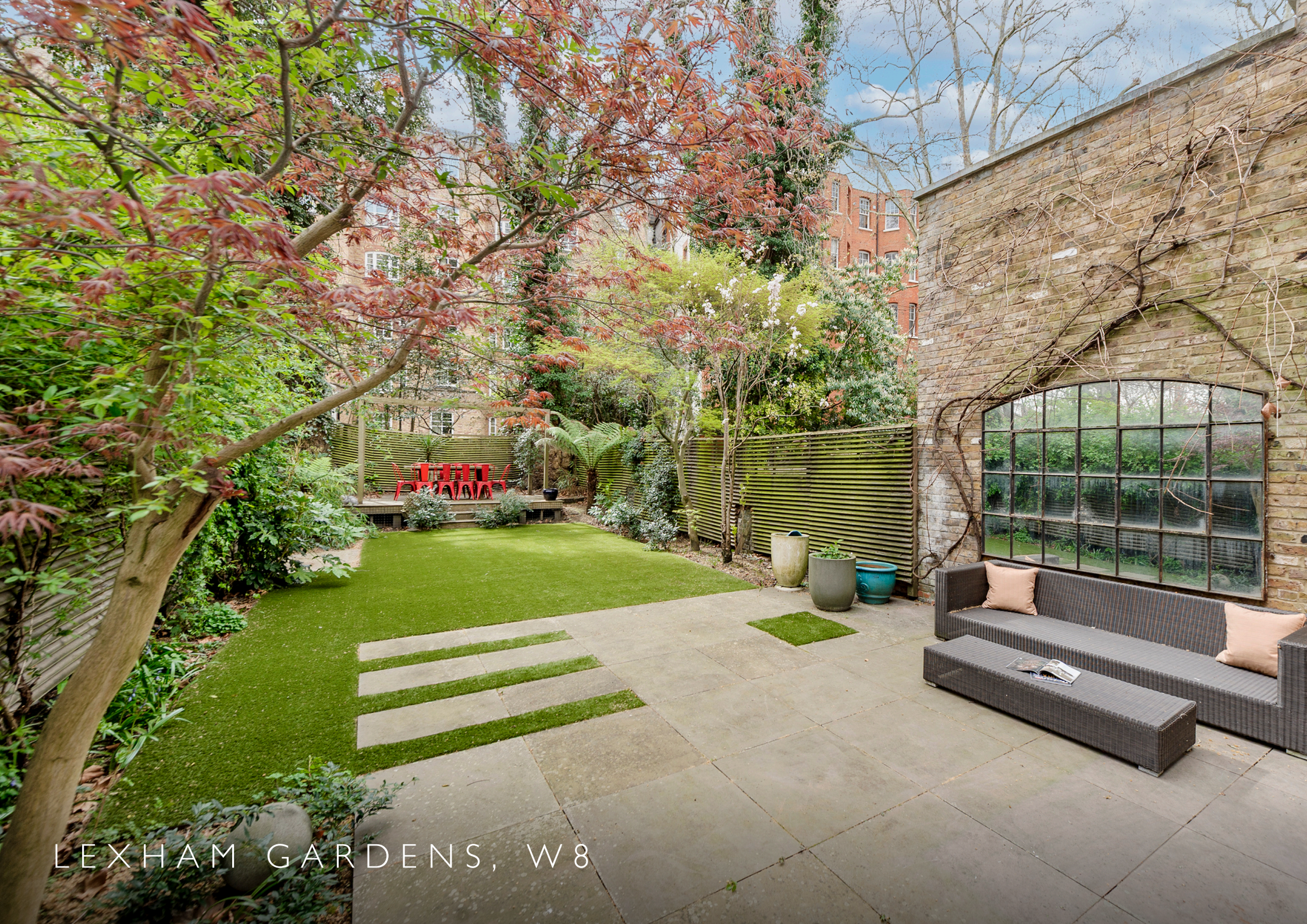
LEXHAM GARDENS, W8