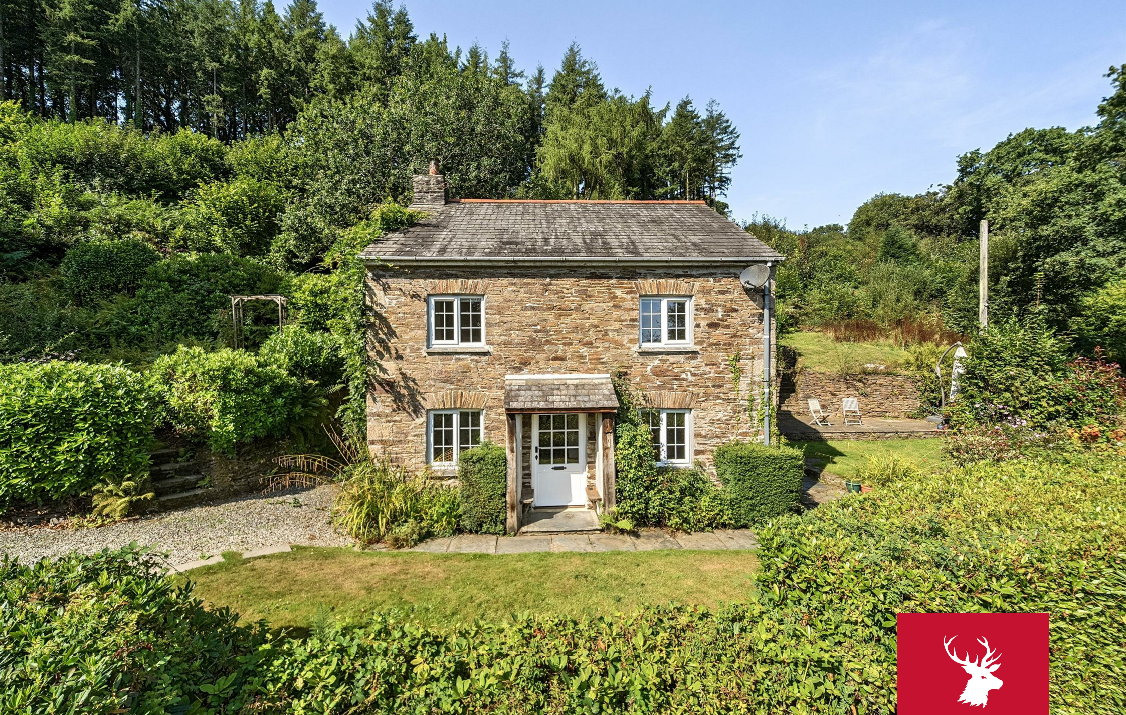
Greenscombe in the Wood