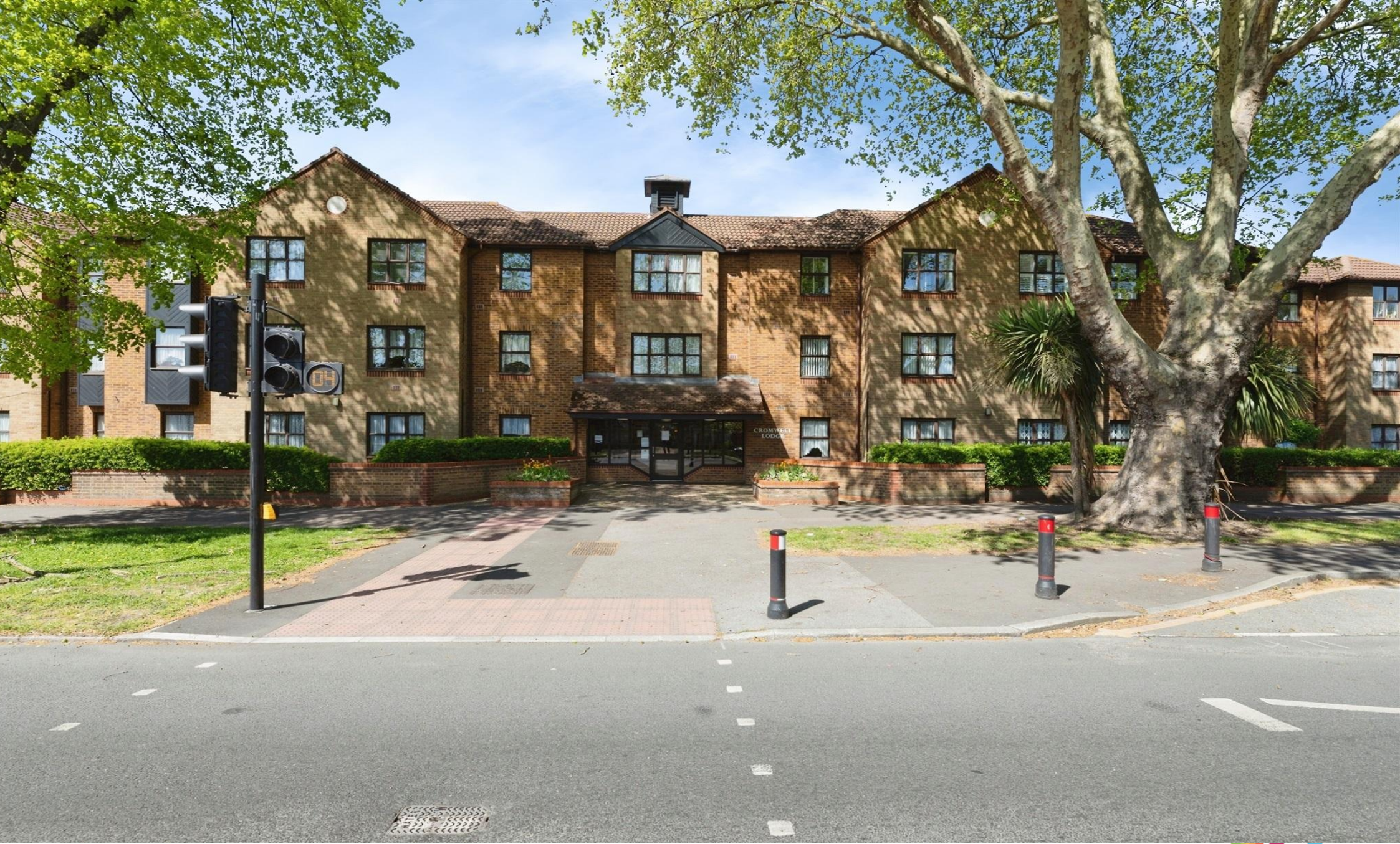
Cromwell Lodge, Longbridge Road, Barking, IG11 8UB