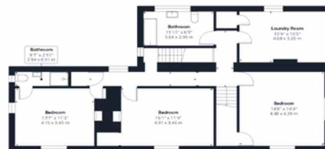
First Floor The Farmhouse