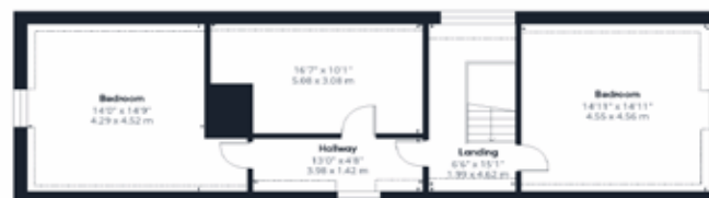
Second Floor The Farmhouse