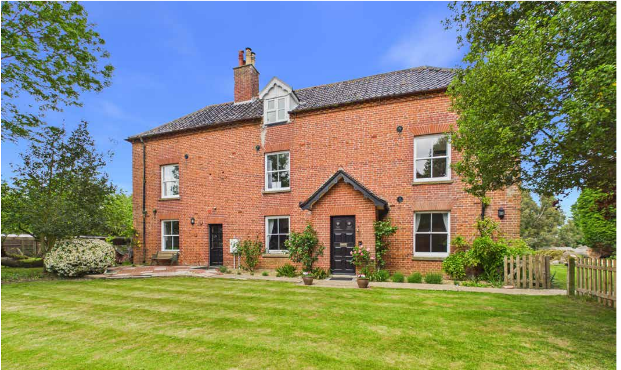
The Farmhouse, Taylors Farm Yarmouth Road | Corton | Suffolk | NR32 5NJ