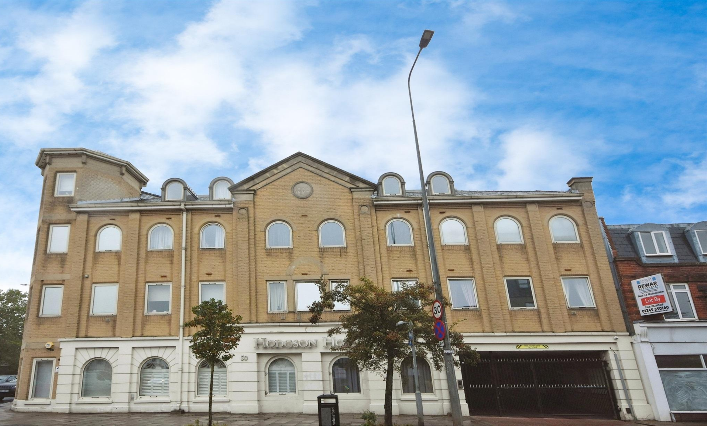
Hodgson House, Rainsford Road, Chelmsford CM1 2XB