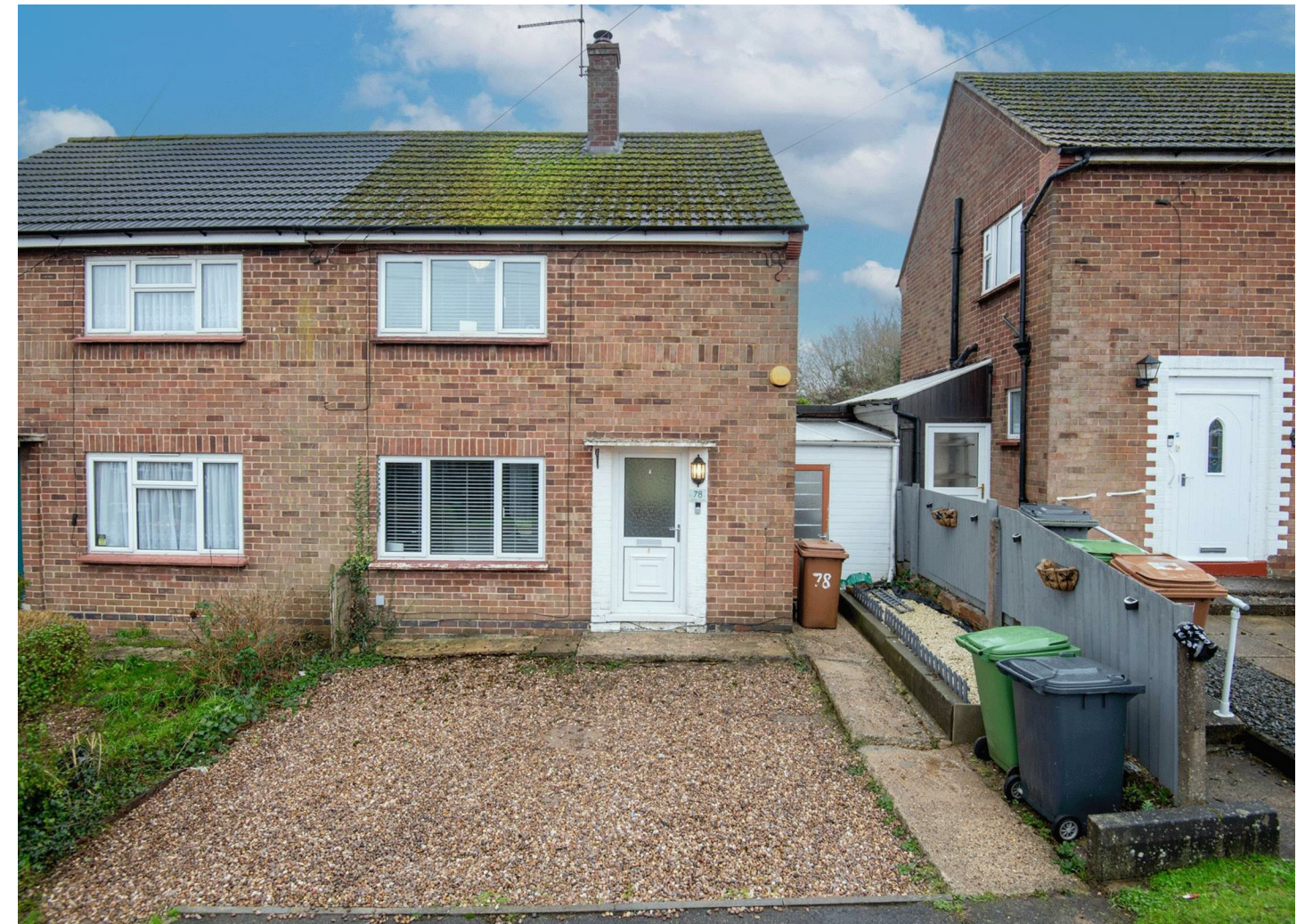
78 Windsor Road, Wellingborough, NN8 2ND