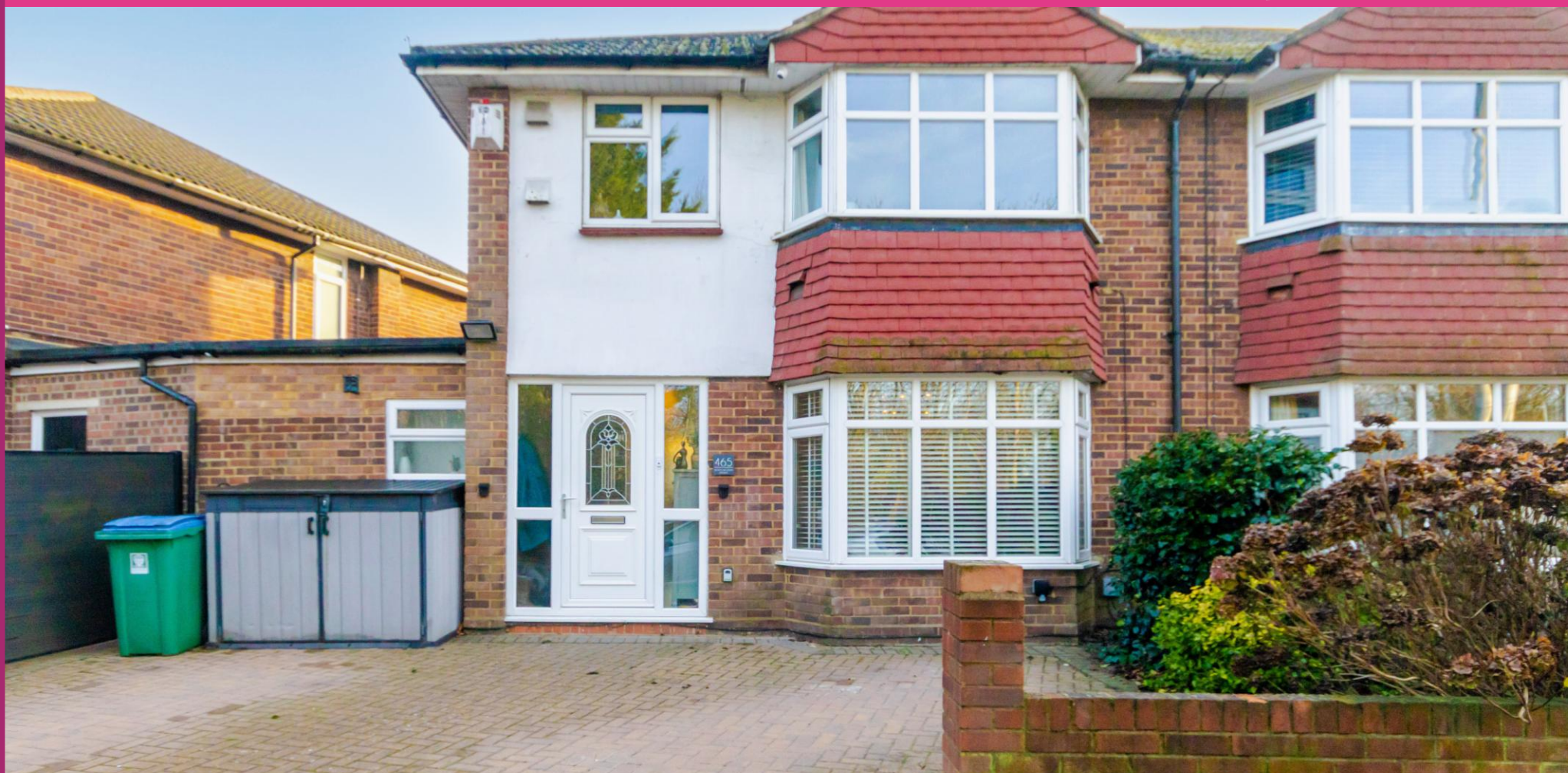
NORTH WESTERN AVENUE, WATFORD – OIEO £550,000 3 Bedroom Semi-Detached House