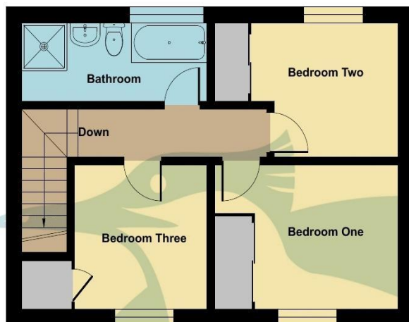
FIRST FLOOR Approx. 518 SQFT (INTERNAL)