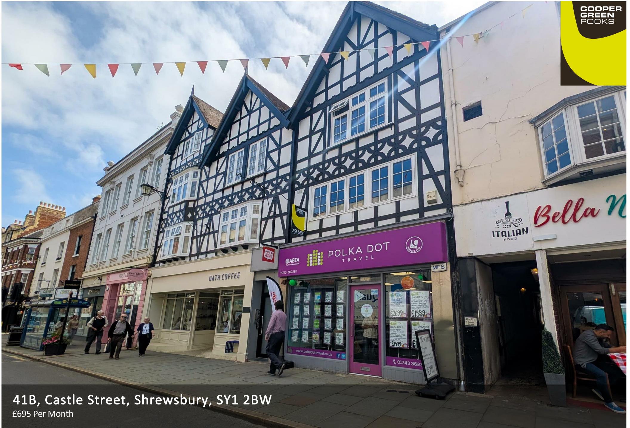
41B, Castle Street, Shrewsbury, SY1 2BW £695 Per Month