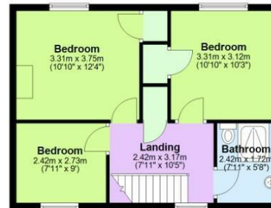
First Floor Approx. 45.6 sq. metres (491.3 sq. feet)

Total area: approx. 151.0 sq. metres (1625.3 sq. feet)