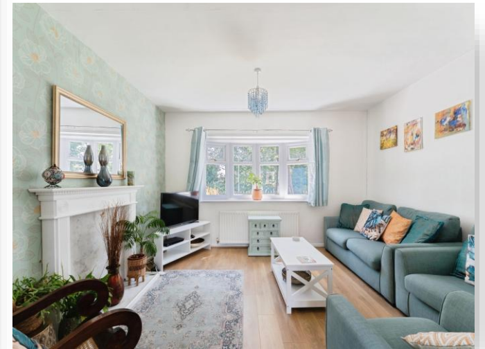
Langley Court, Ellesmere Port CH65 9EE