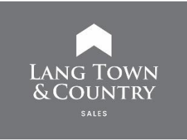
23 Garden Village, Plymstock, Plymouth, PL9 7EN

LANG TOWN & COUNTRY FOR SALE 01752 266000