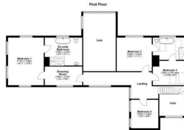
Approx gross internal floor area 344 sqm (3700 sqft) excluding Voids, including Garage and Storage Rooms

These particulars, whilst believed to be accurate are set out as a general outline only for guidance and do not constitute any part of an offer or contract. Intending purchasers should not rely on them as statements of representation of fact, but must satisfy themselves by inspection or otherwise as to their accuracy. No person in this firm's employment has the authority to make or give any representation or warranty in respect of the property.