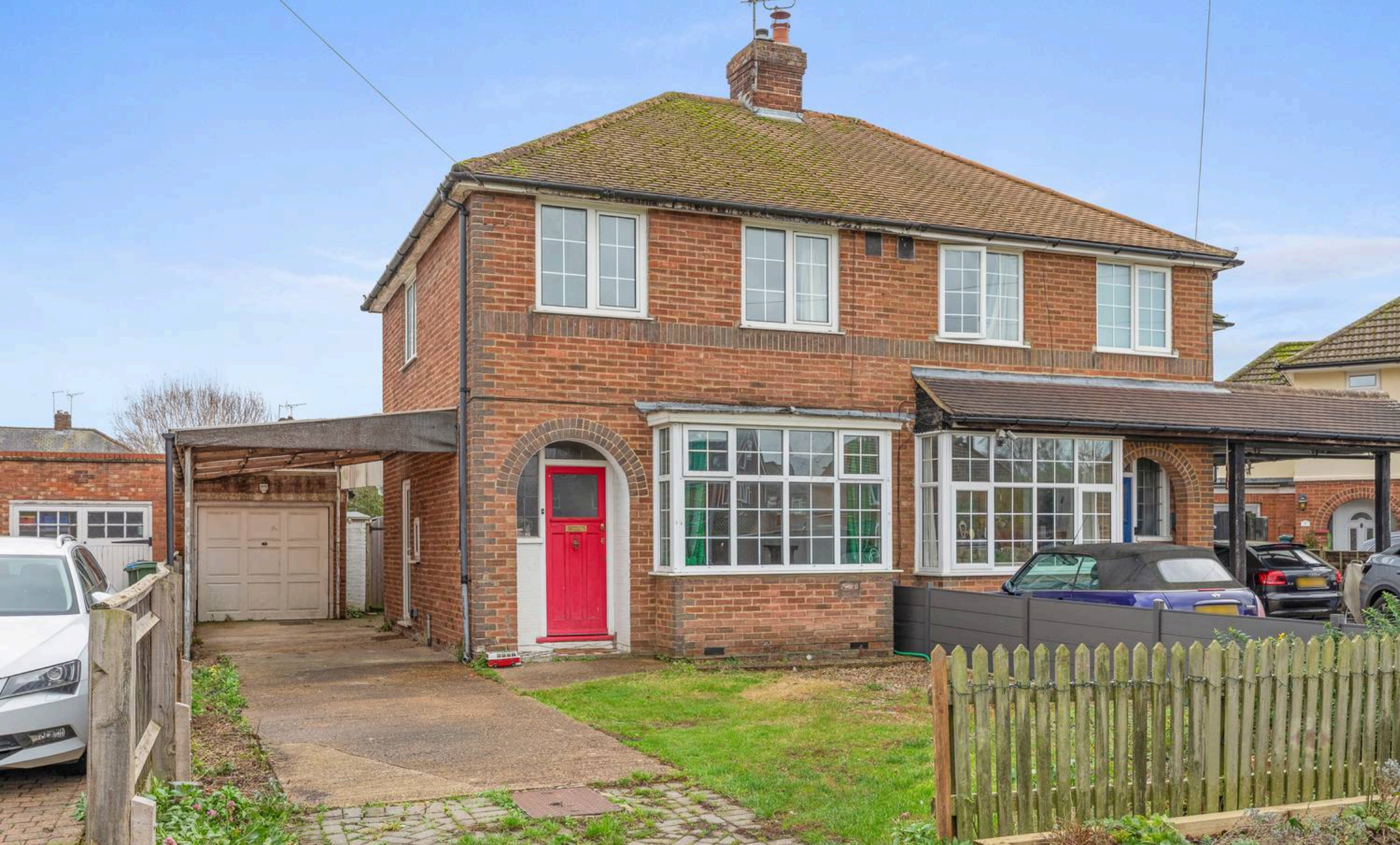
Stanhope Close, Wendover £530,000