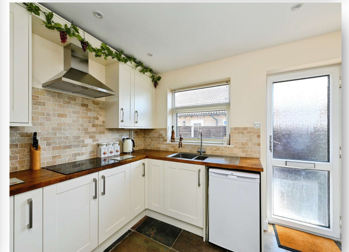
Windsor Rise, Hunstanton, PE36 5JE