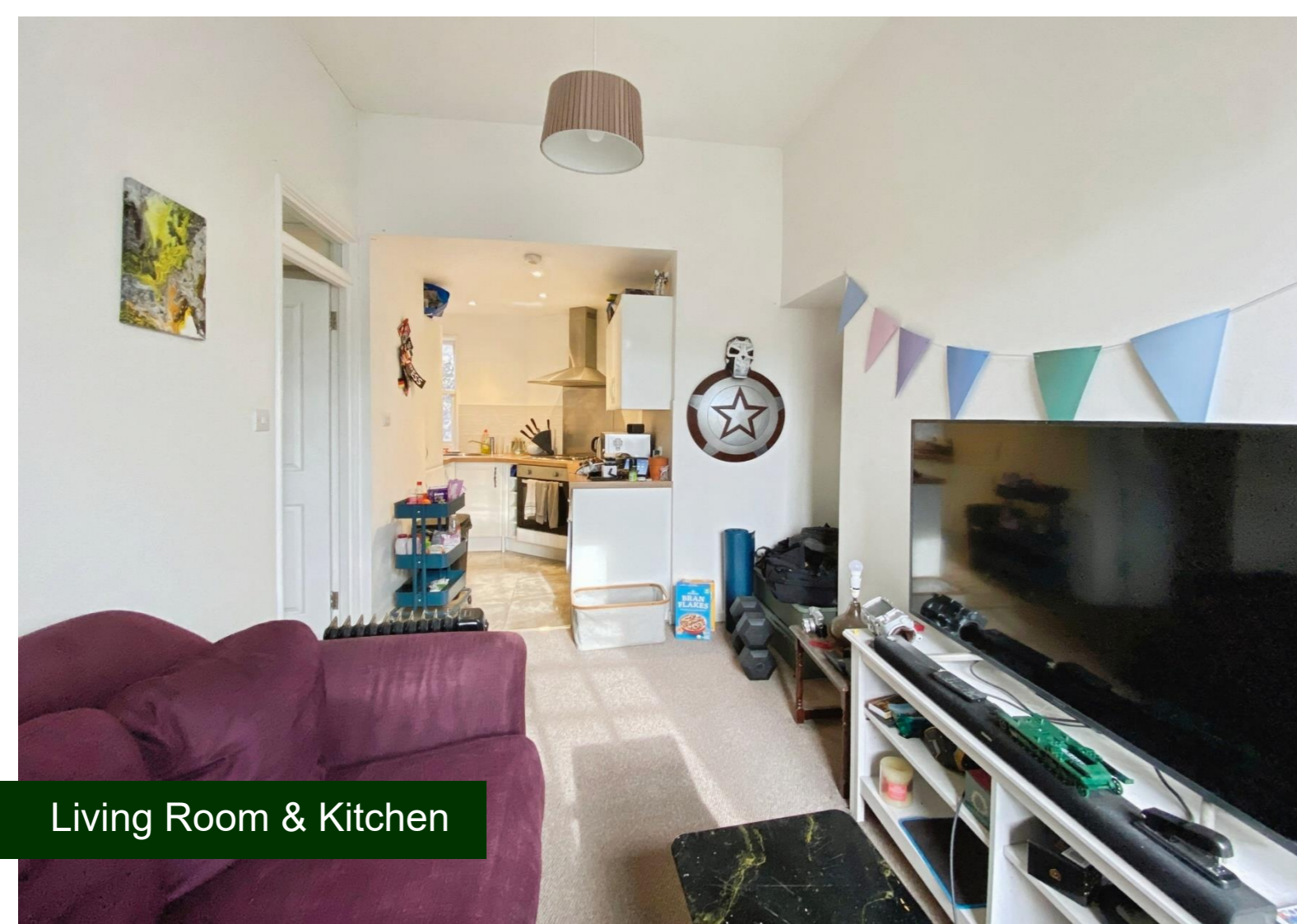
Living Room & Kitchen