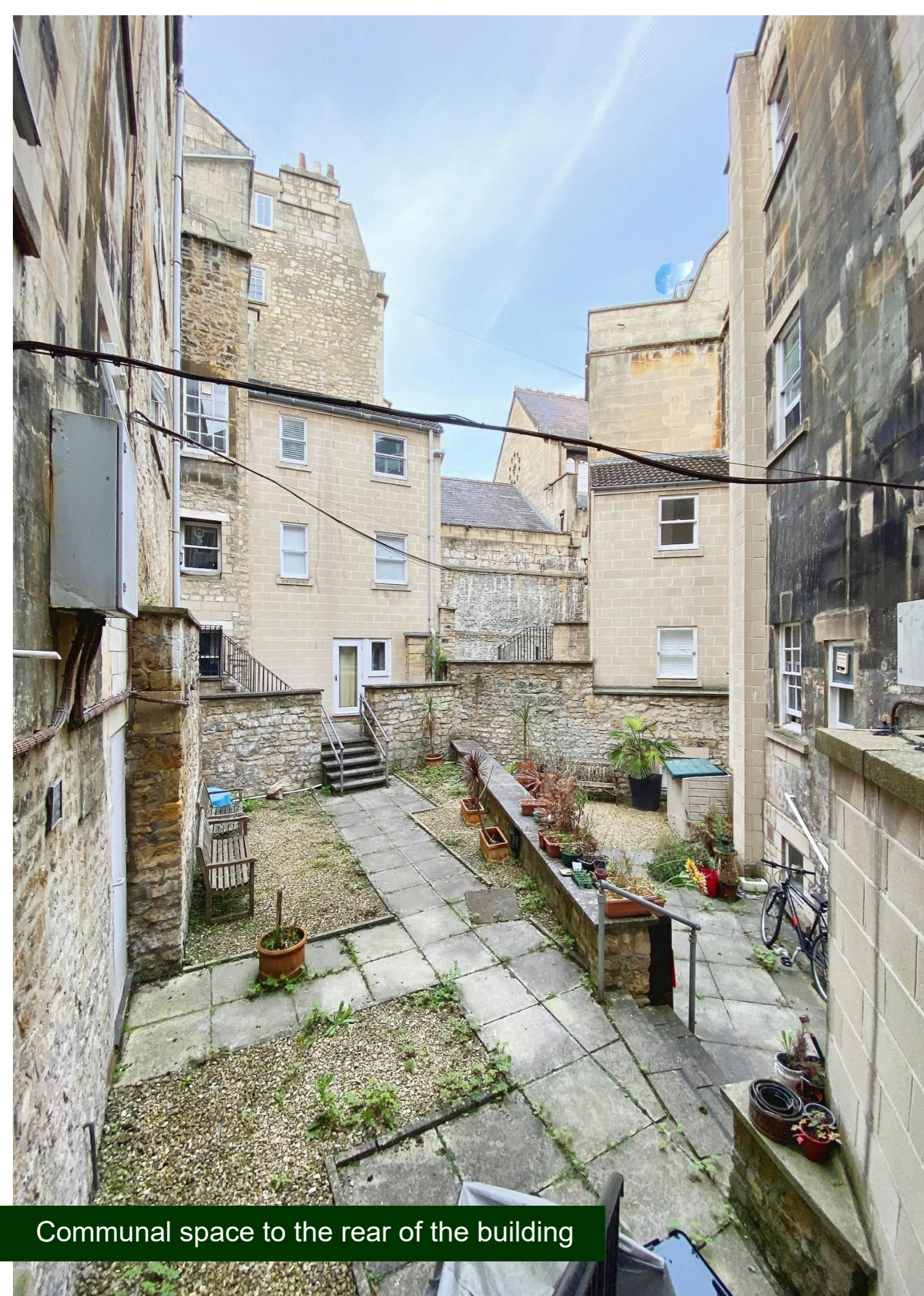
Communal space to the rear of the building