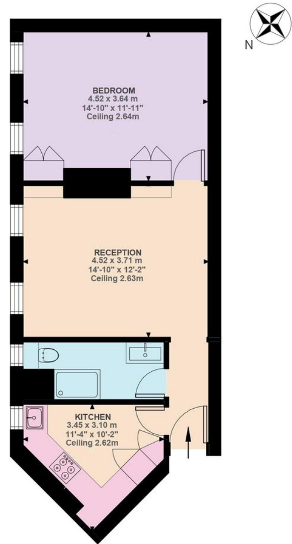
First Floor 539 ft 2

Mallord Street, SW3 Approximate Gross Internal Area = 50.03 sq m / 539 sq ft