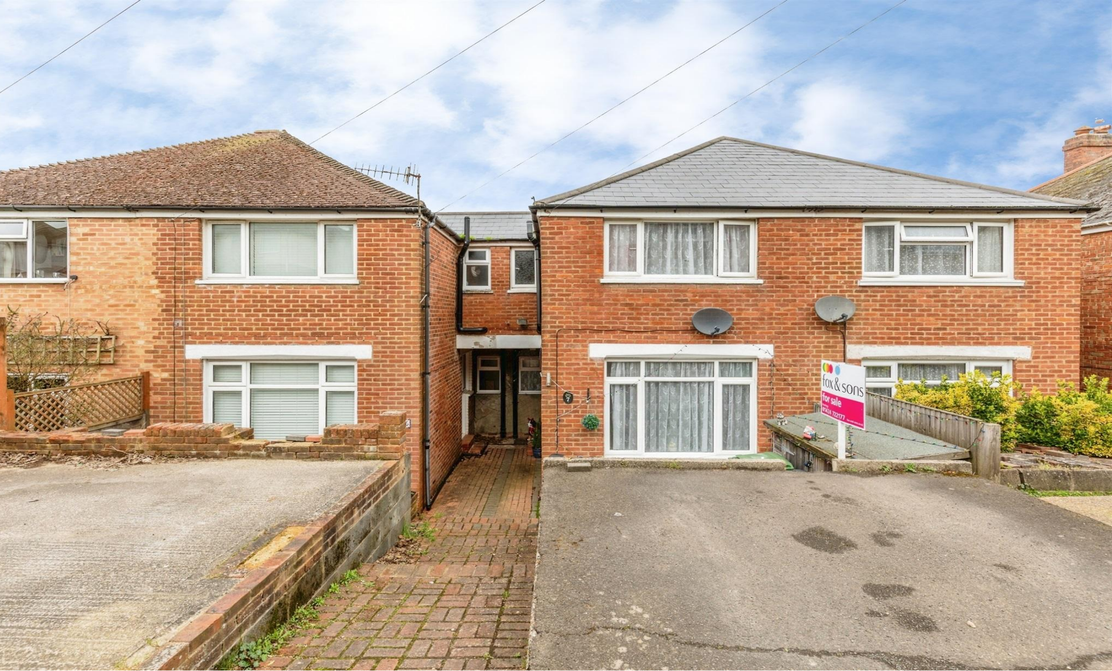
Oakfield Road, HASTINGS TN35 5AX