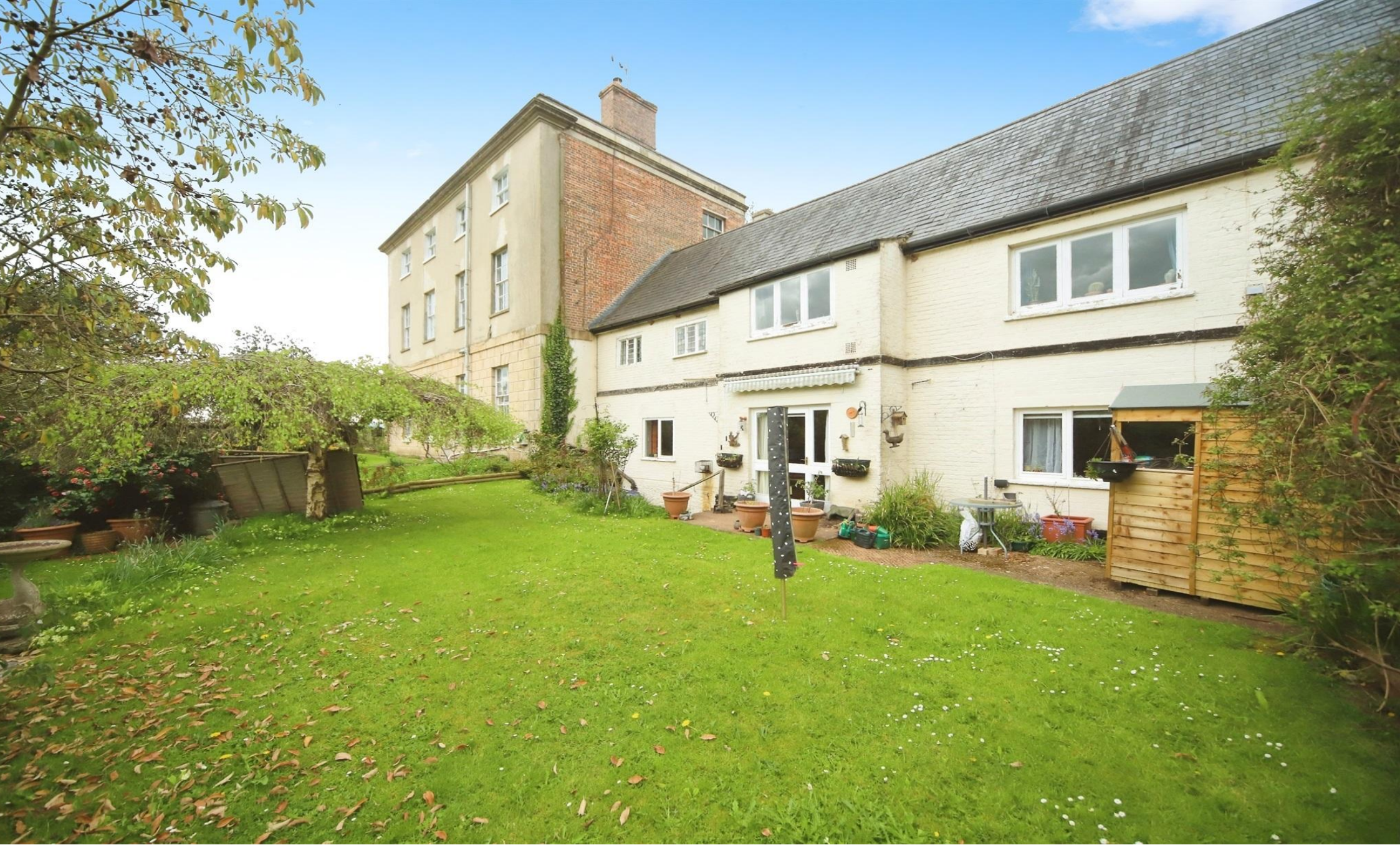
Flat 7 Walford House, Walford Cross Taunton TA2 8QW