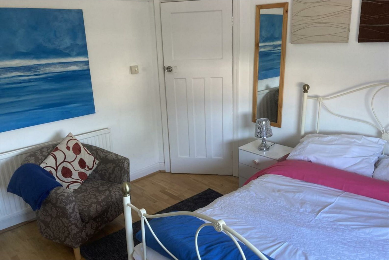
First Floor Room, 55 Twitten Way, Worthing, West Sussex, BN14 7JU Per Month £685 Per Month

**ALL BILLS INCLUDED** A spacious and very well presented FURNISHED first floor double room within this well maintained home. Located close to West Worthing railway station, where local shops can be found in South Street & Tarring Road. This property has a shared modern bathroom, a communal living room, dining room communal kitchen with built in appliances and communal gardens to the property. **SINGLE OCCUPANCY ONLY**