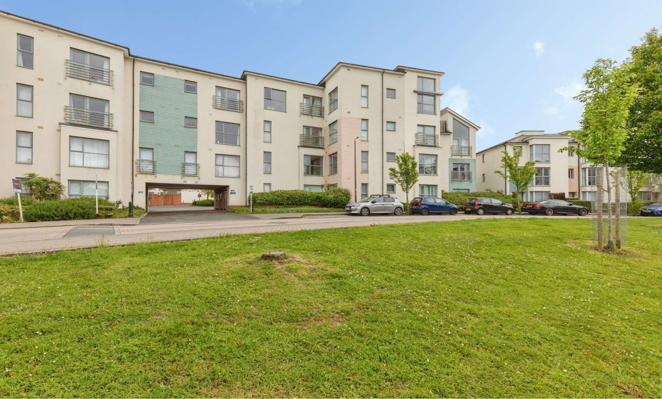
Long Down Avenue, Bristol BS16 1FT