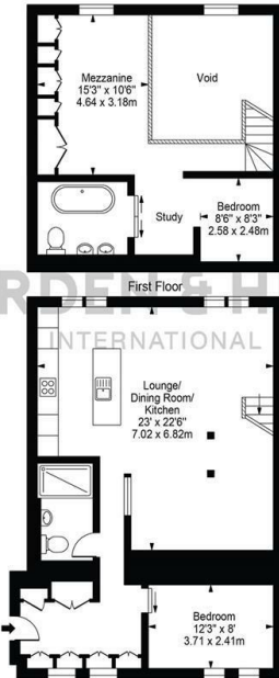
Ground Floor For Illustration Purposes Only - Not To Scale

Clock Court, Victory Road Approx. Gross Internal Area 1145 Sq Ft - 106.35 Sq M (Excluding Void)