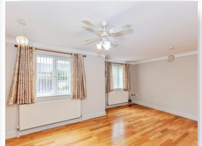
Lillicourt House Lower Street, Kettering NN16 8DL