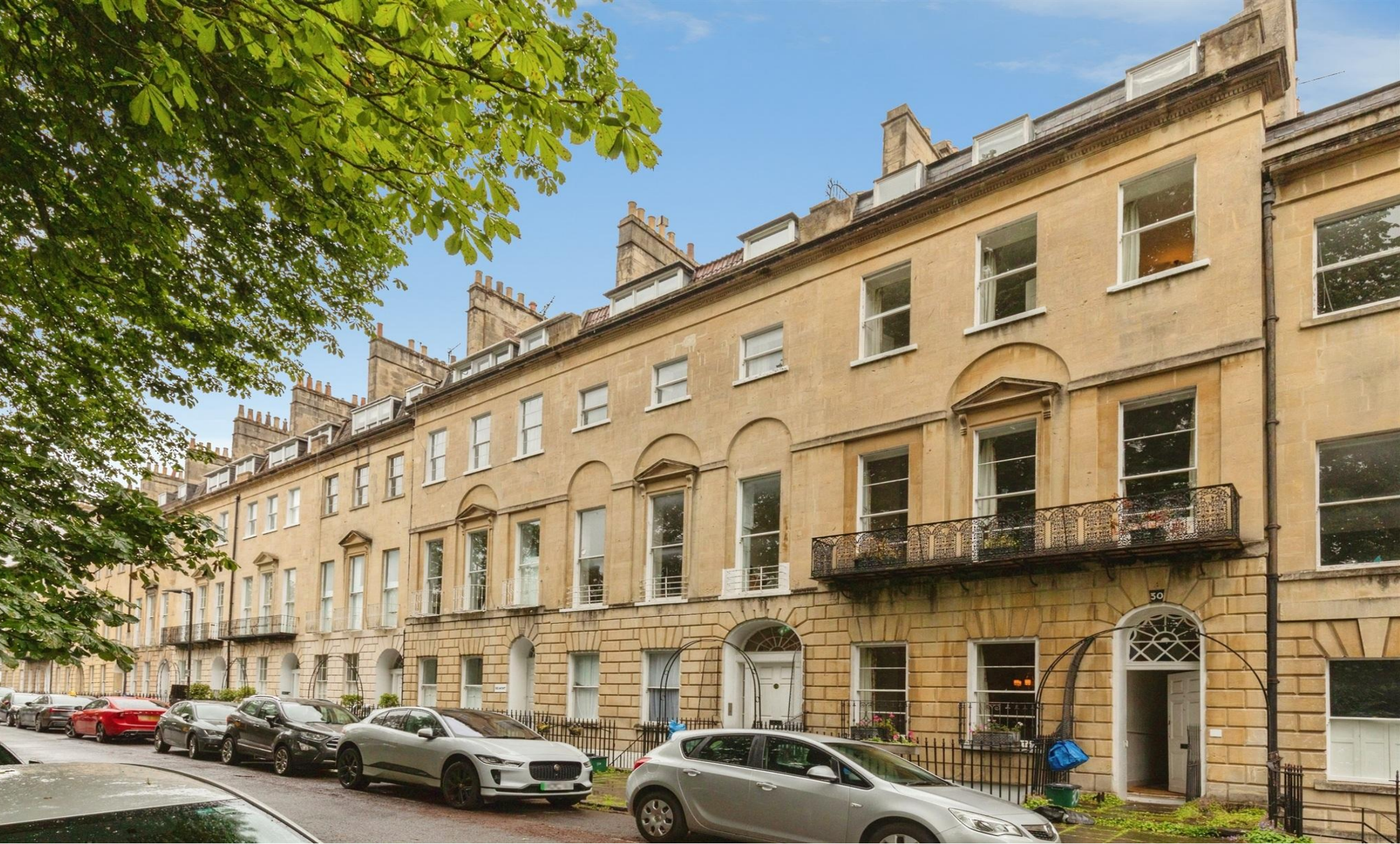
Flat 2b Green Park, Bath BA1 1HZ