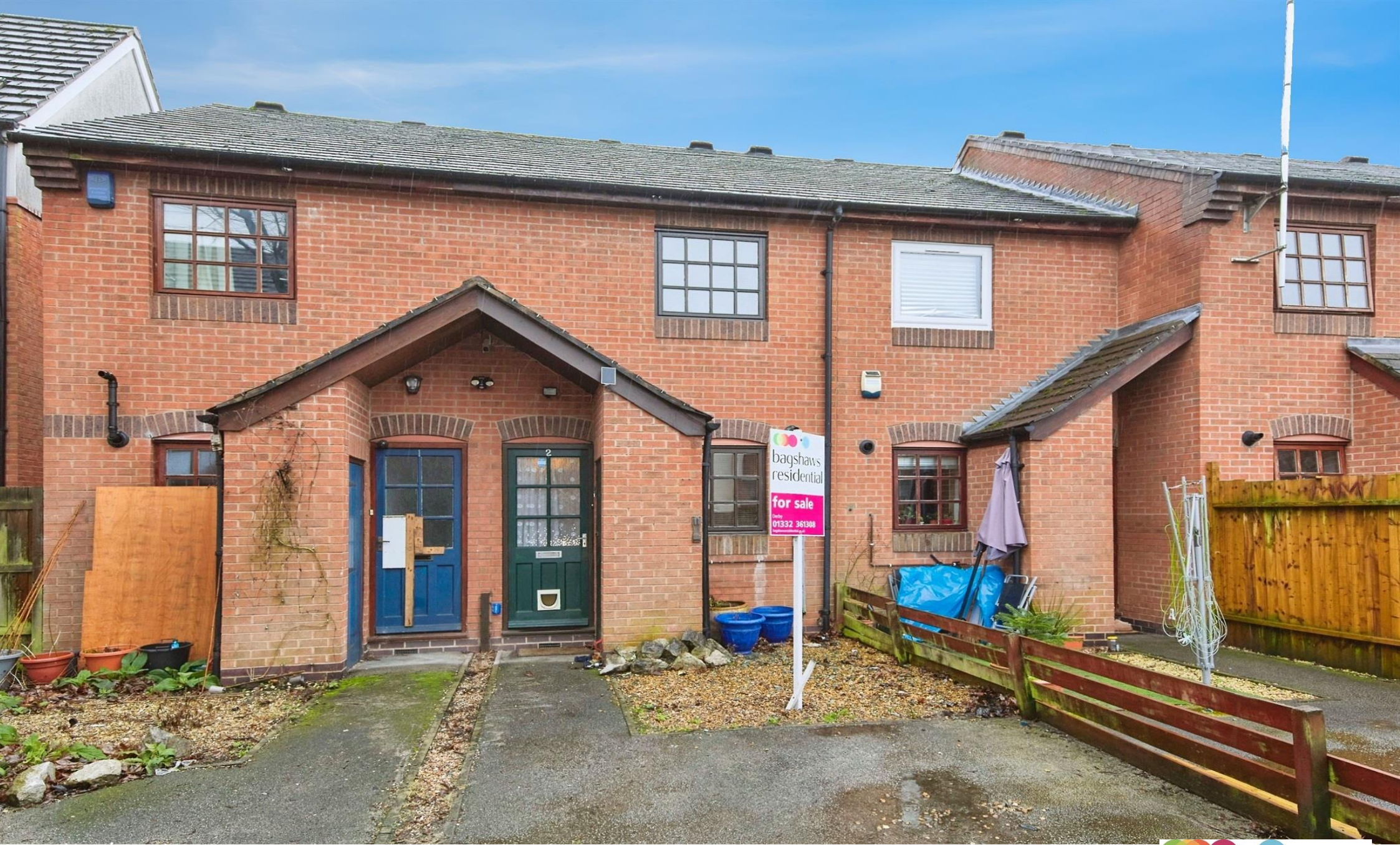
Vale Mills Boyer Street, Derby, DE22 3TE