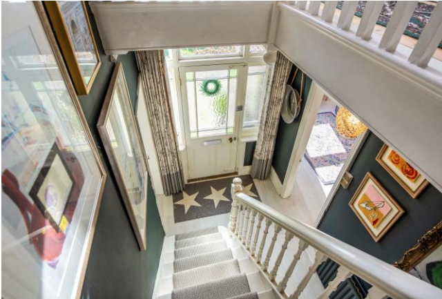
AND SO TO BED: A beautiful staircase rises to the first floor and the impressive galleried landing, illuminated by a large sash window that fills the space with natural light.