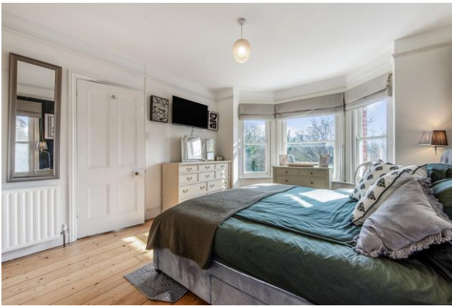
The Principal Bedroom is particularly impressive, with large bay windows capturing superb views across the River Itchen and surrounding countryside.