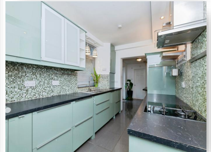
Walton Villa Walton Street, Leicester LE3 0DX