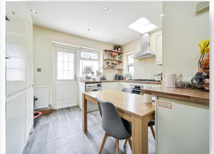
St. Wilfrids Avenue, Leeds LS8 3PD