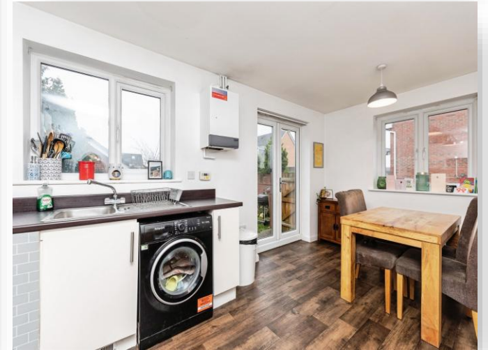
Forest Yard, Middleton Leeds LS10 4WN