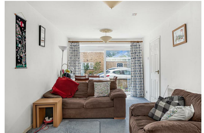
Illustration for identification purpose only, measurements are approximate, not to scale.