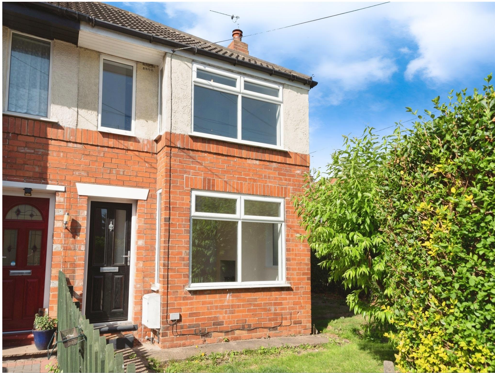
Cherry Tree Lane, Beverley, HU17 0BD