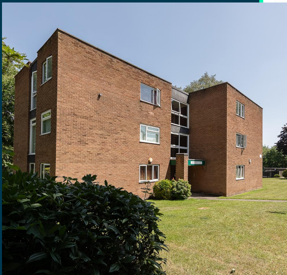
Aston Court, Norton Walk, Birmingham, B23