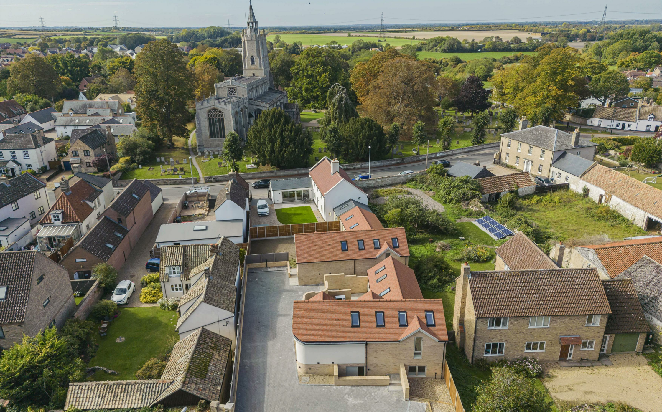
Pudding House, Mill Lane, Burwell CB25 0HJ