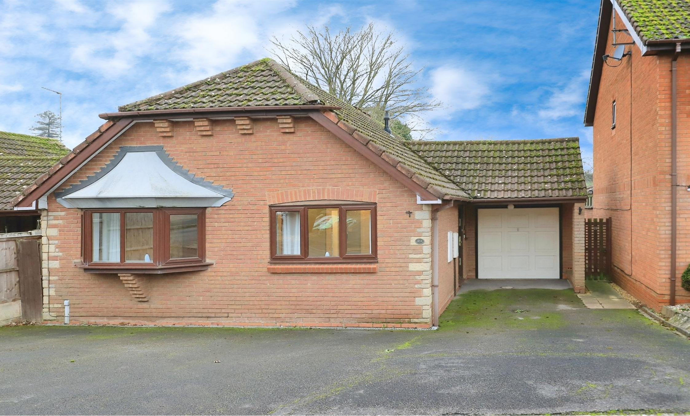
Damson Way, Bewdley DY12 1EZ