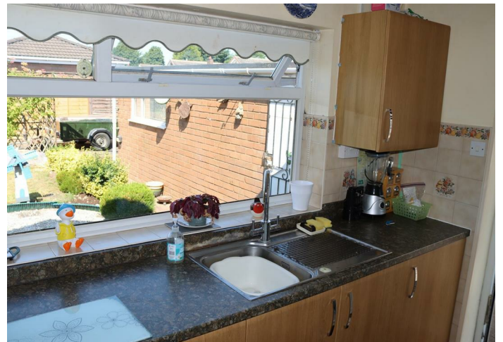
Modern Fitted Kitchen