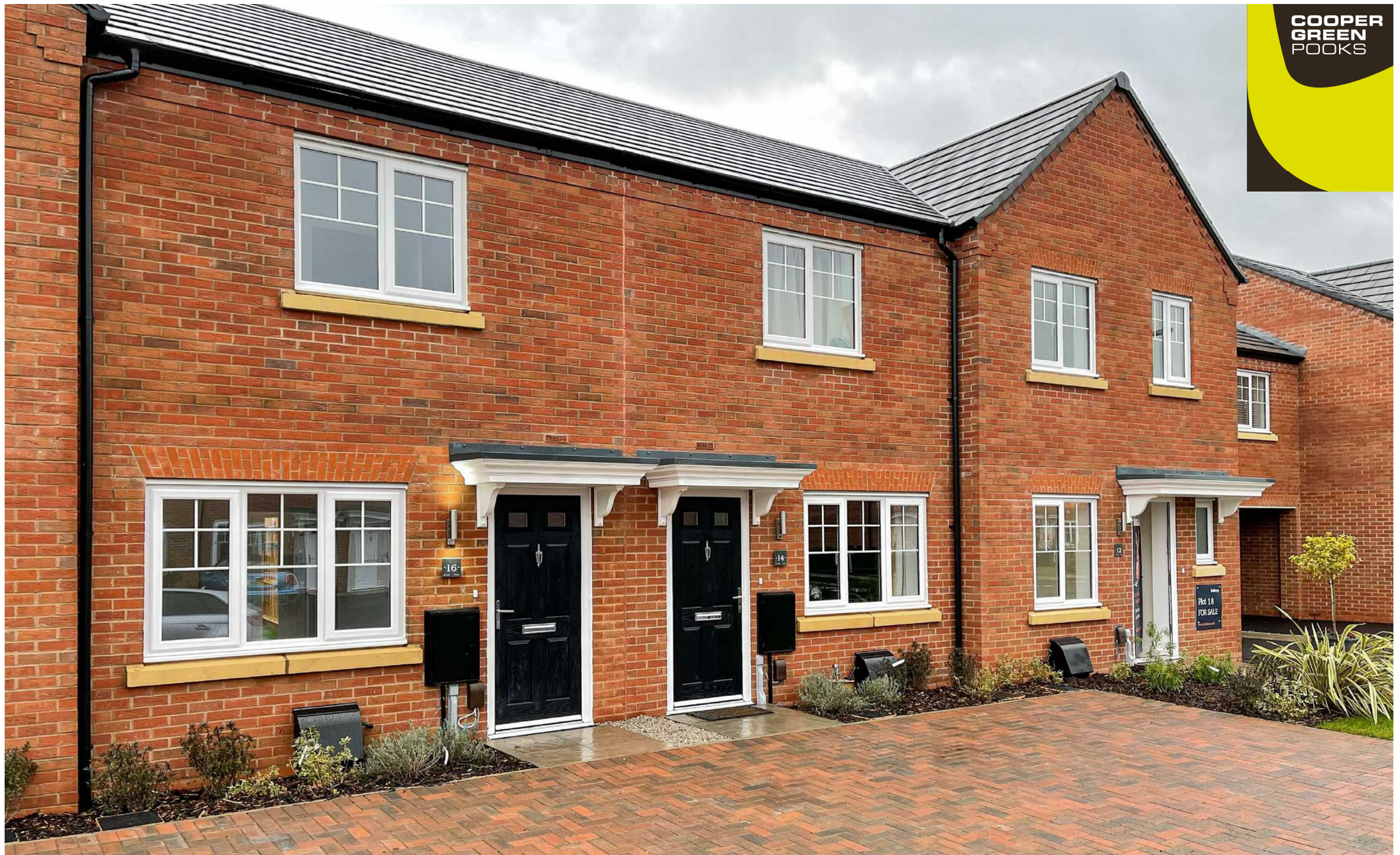
16, Whitfield Crescent, Copthorne Keep, Shrewsbury, SY3 8FD £1,050 Per Month