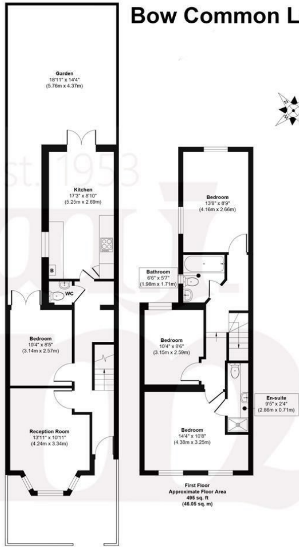
Approx. Gross Internal Floor Area 999 sq. ft / 92.96 sq. m Illustration for identification purposes only, measurements are approximate, not to scale. Produced by Elements Property