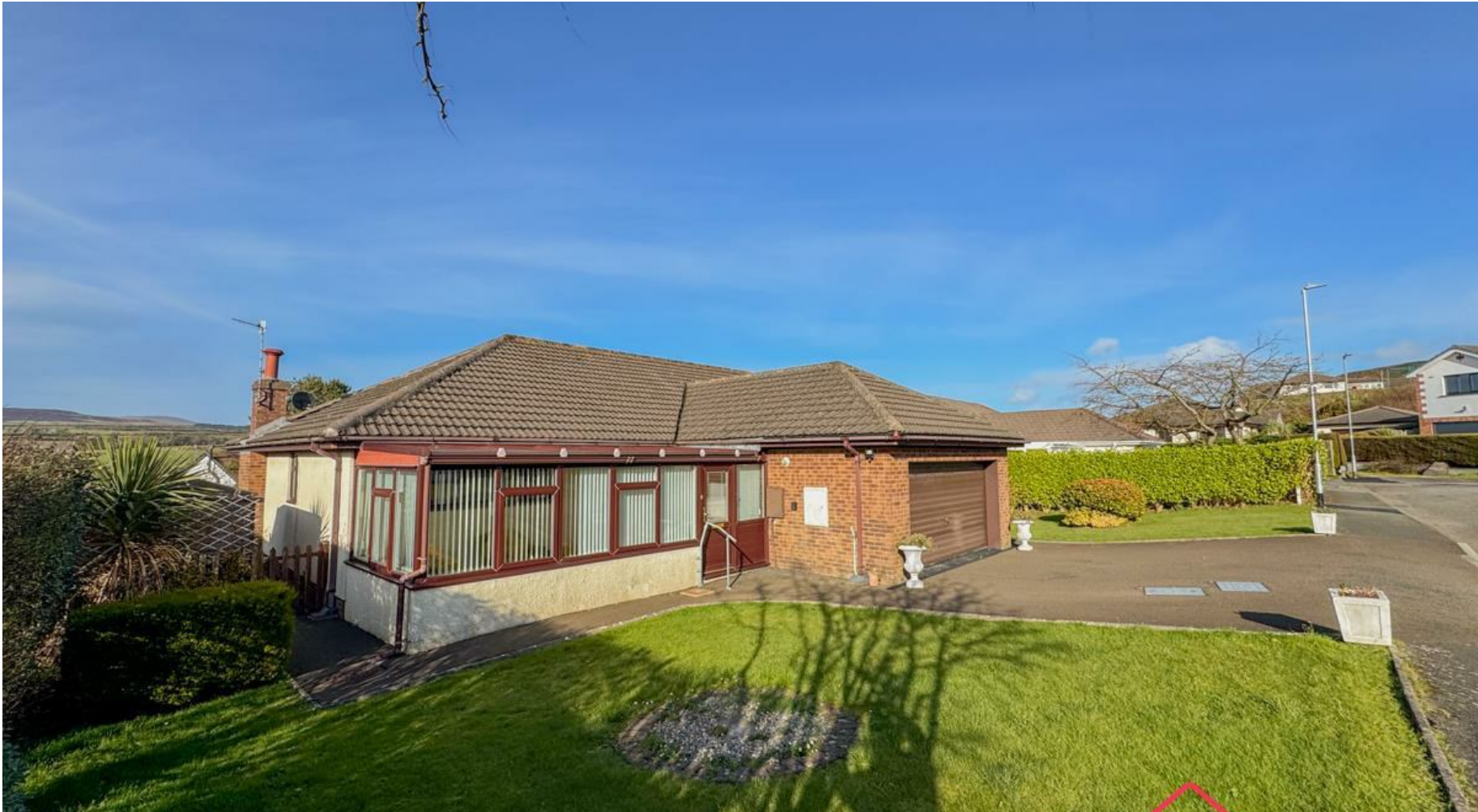
7 Turnberry Avenue, Onchan, Isle Of Man, IM3 2JS Asking Price £675,000