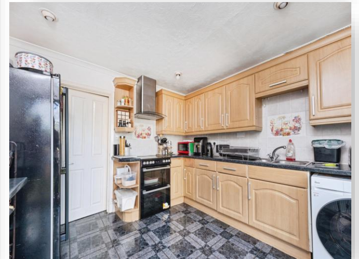
Ferndale, Eaglestone, Milton Keynes, MK6 5AE