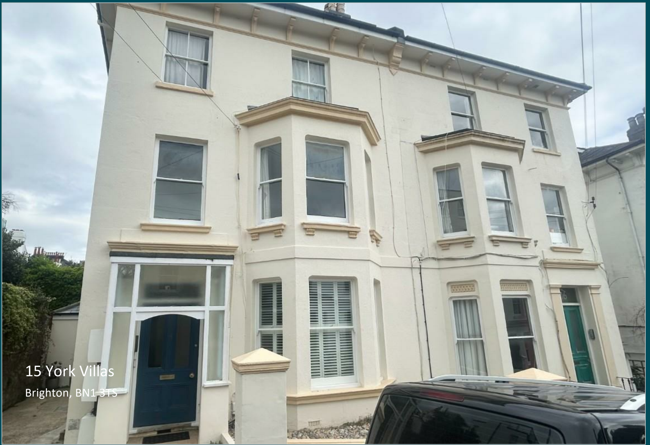
15 York Villas Brighton, BN1 3TS