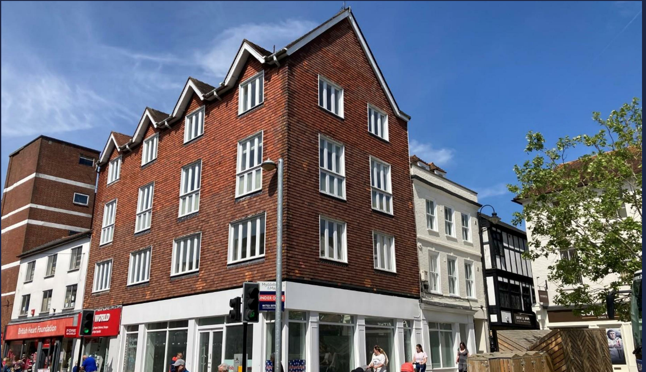
Flat 1, 44 New Canal, Salisbury