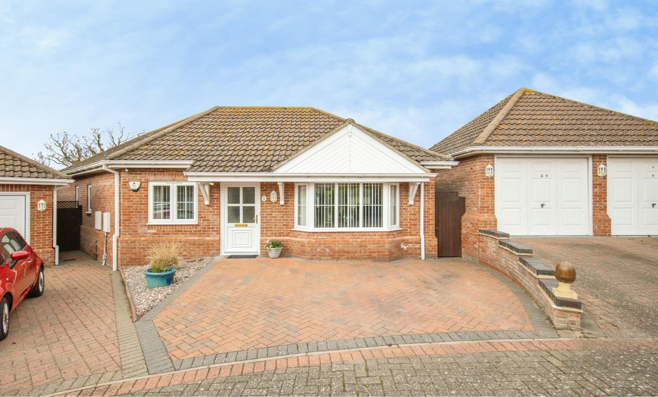
The Acorns, Clacton-On-Sea CO15 2QW