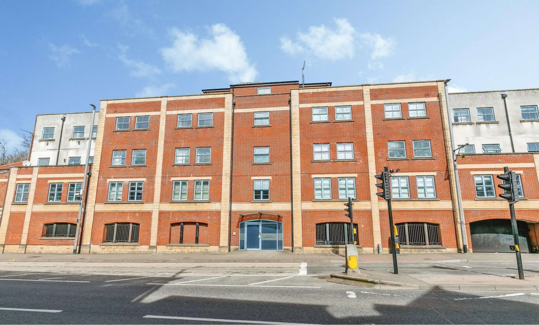
Harbour House Hotwell Road, Bristol BS8 4UB