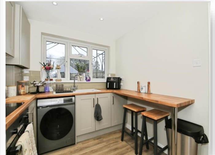
Bevills Close, Doddington PE15 0TT