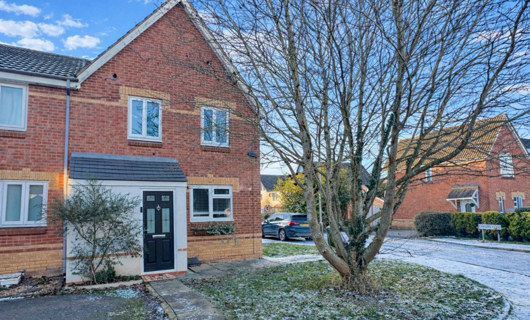
14 Taverners Road, Leicester £280,000